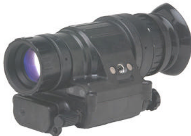
PVS-14D Monocular with Eotech Holosight "The Total Night Vision Package"