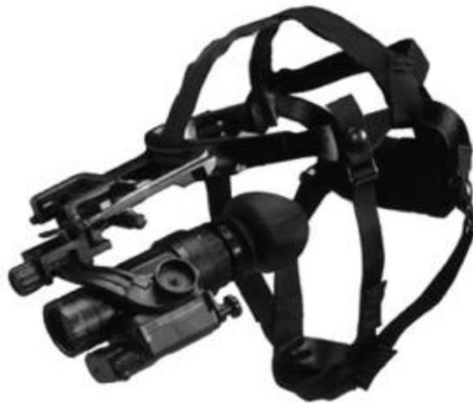
NQ-6015 with Adjustable Headmount System